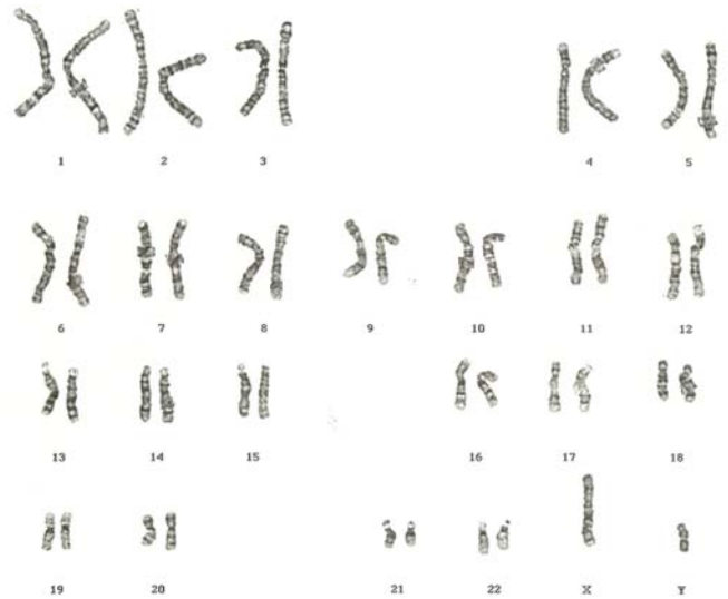
Normal Male Karyotype