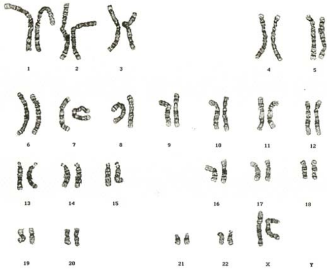
Normal Female Karyotype